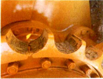
Left Track Rollers 7