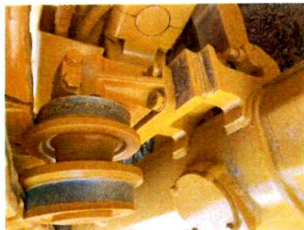
Left Carrier Rollers 1