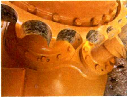
Left Sprockets 1