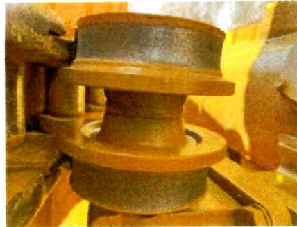
Right Carrier Rollers 1