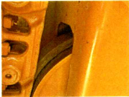
Left Idlers 1