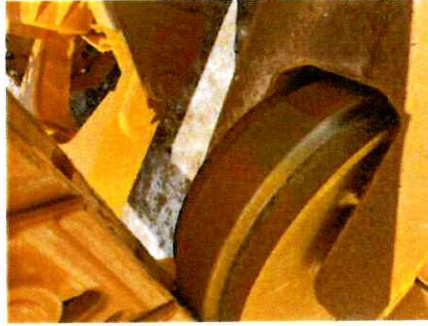
Right Idlers Rear