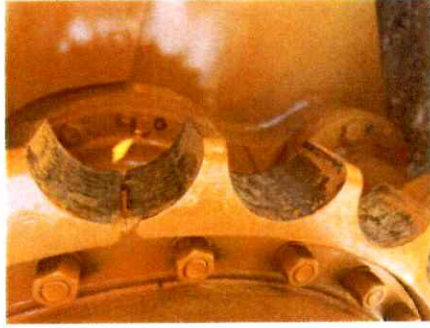
Right Sprockets 1