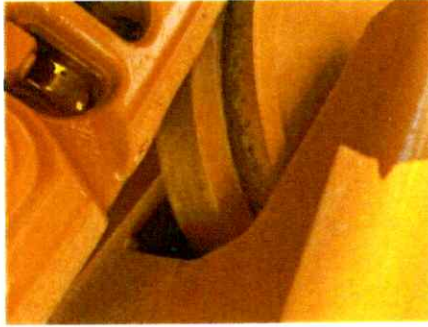
Right Idlers 1