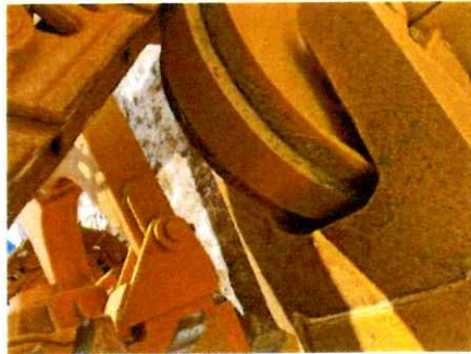
Left Idlers Rear