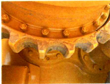
Left Sprockets 1