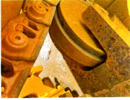
Right Idlers 1