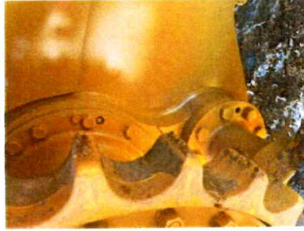
Right Sprockets 1