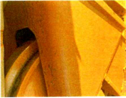
Left Idlers 1