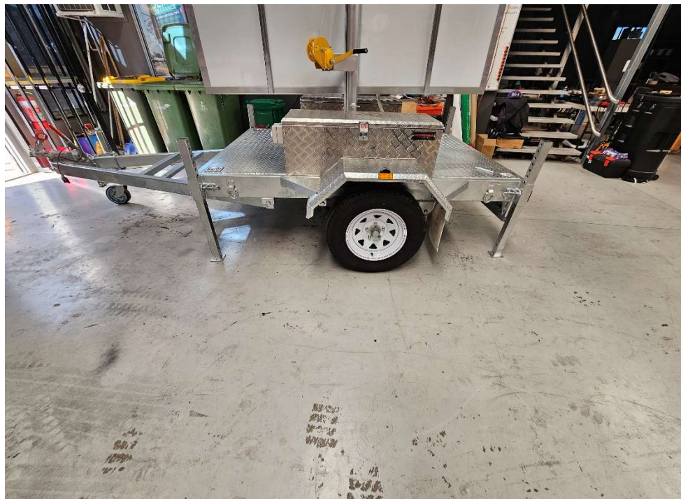
Rear Supports Down First