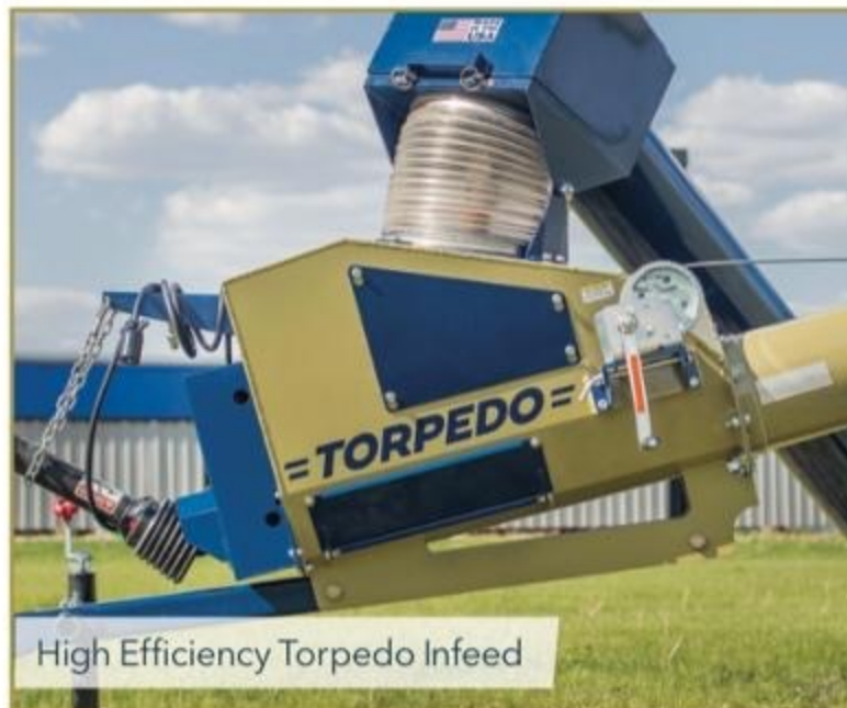
High Efficiency Torpedo Infeed