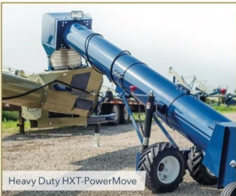
Heavy Duty HXT-PowerMove