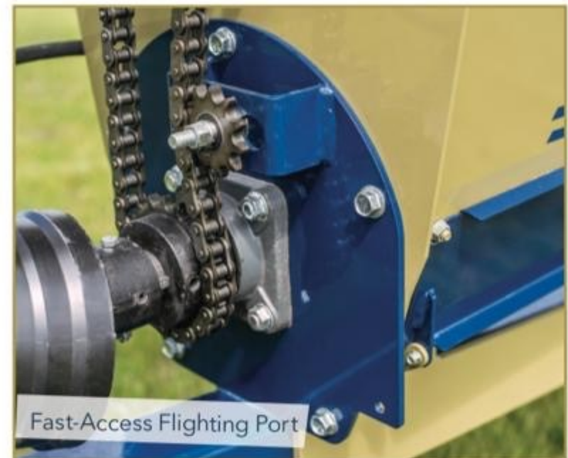
Fast-Access Flying Port