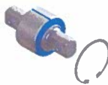
TS96-22700 Straddle Bushing

Replaces: Volvo Fits in TR96-45568 & TR96-49046