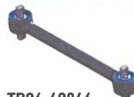
TR96-49046 Torque Rod (1 7/8" Offset)