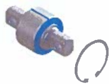
TS96-22600 V-Rod End Bushing