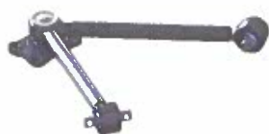
TR96-44004 V-Rod Assembly

Replaces: Volvo 20367004; 20507262; 20741695; 20741703; 22318833