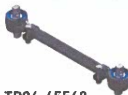
TR96-45568 Torque Rod, Adjustable (Offset)