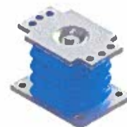
LP96-24657 Load Spring

Replaces: Volvo 1089501, 1577873, 1609657, 1629553, 20390836, 3090971, 8151413, V1609657, V1629553