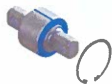
TS96-22286 V-Rod End Bushing

Replaces: Volvo 20547286; 271187; 3092452