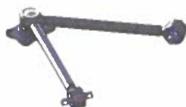
TR96-44829 V-Rod Assembly