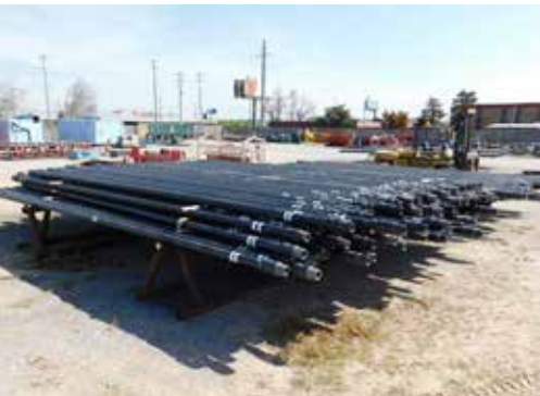
(7300 Ft) 5-Inch S-135 DWB Drill Pipe – Yd 17