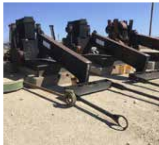
Lufkin D228G Pump Jack