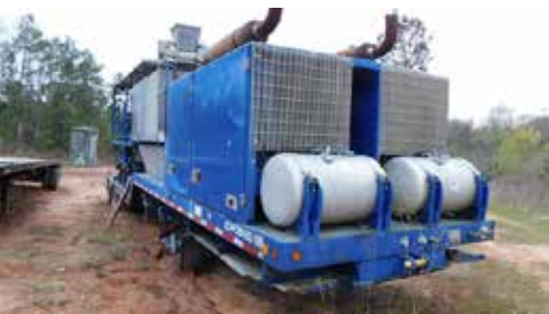
2006 Fammco Cement Double Pumper