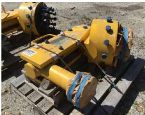
Lower Gooseneck Assembly