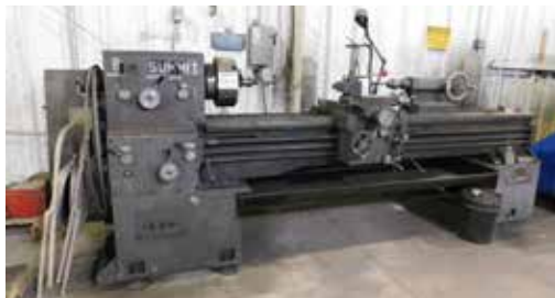
Summit Machine Lathe