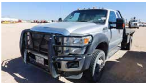
2015 Ford F550 Flatbed