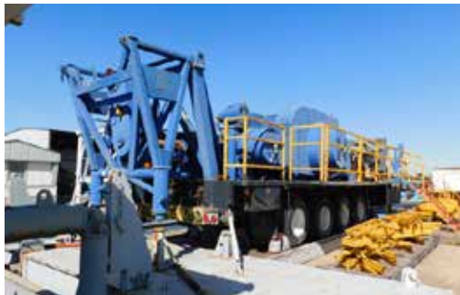
RG JC28B 1000HP Drilling Rig – Yd 5