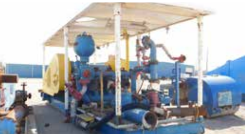
G.Denver PZ11 Triplex Mud Pump