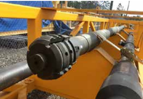
GE Crossover Tool