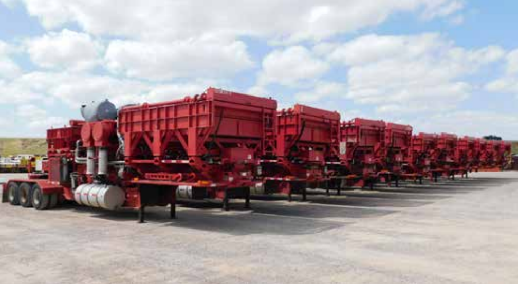
10 – Mertz Frac Pump Trailers – Yd 1