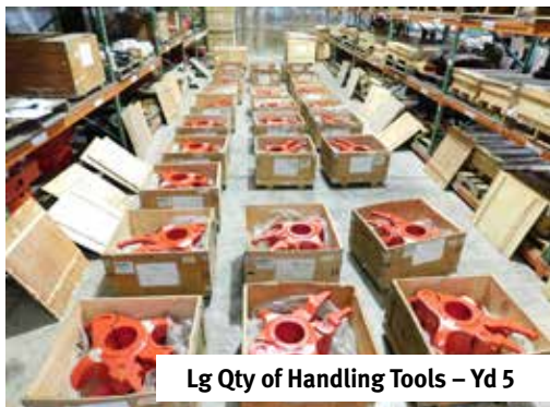
Lg Qty of Handling Tools – Yd 5