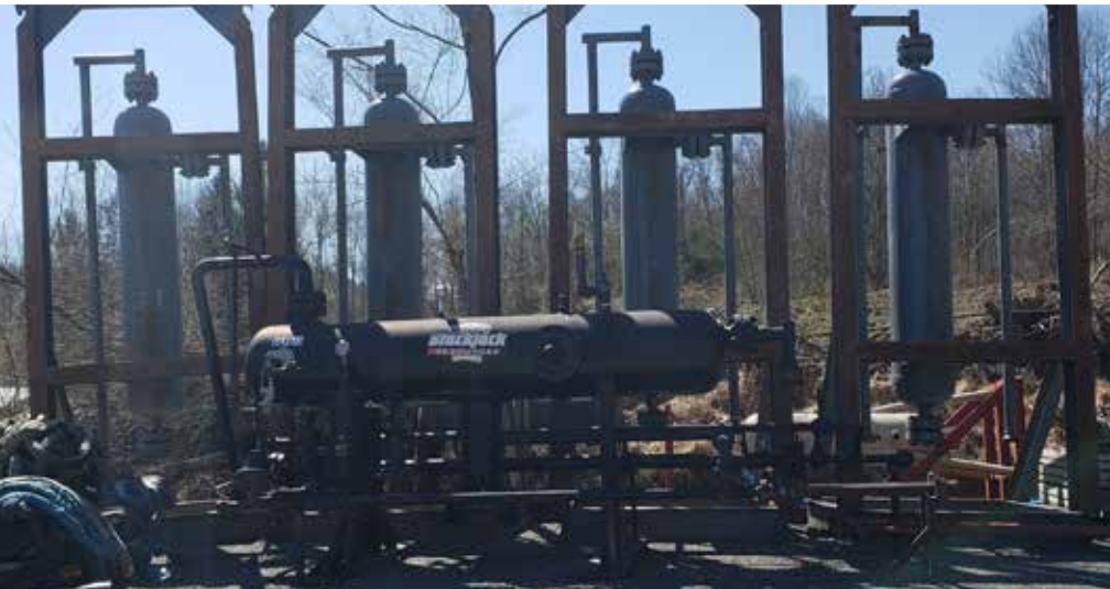
Sandtraps & Separators