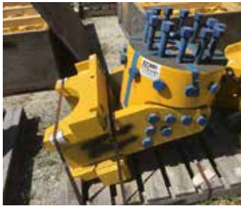
URA Front Kick-Off Spool