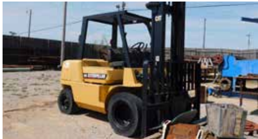
Caterpillar 90 Forklift