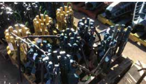
Drill Collar Slips