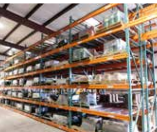
Lg Qty of Unused Surplus Yd 5

Drilling Surplus, Offshore Drilling, Handling Tools, Frac Trailers, BOP Transport Trucks, & Much More