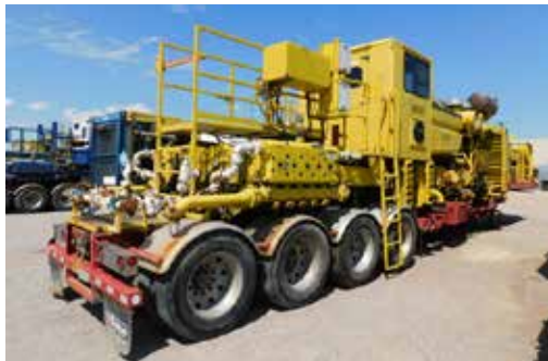
2011 Enerflow MPF2000DW Quintuplex Double Pumper