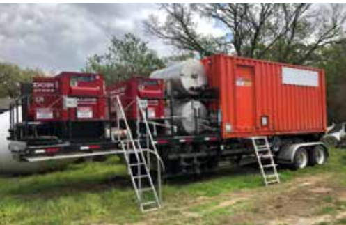
MI Swaco Fluid Waste Mgmt Unit – Yd 12