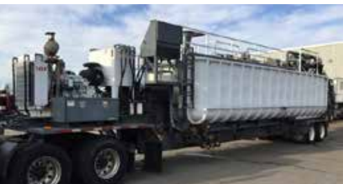
200-Bbl Mobile Mixing Unit