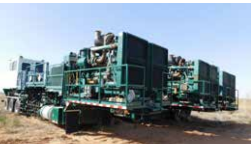
8 – Enerflow BL-125 Frac Blenders