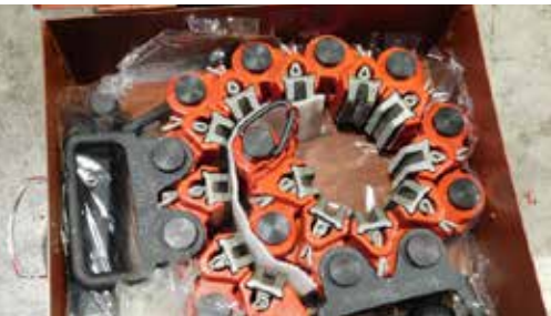
Safety Clamp w-Case