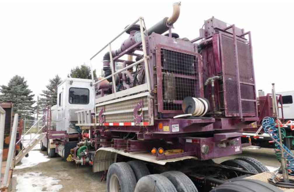
2006 NOV Hydra Rig Nitrogen Pumper

Checkout: May 5th thru May 21st M-F, 8-4 | Contact: EJ Foley @ 570.404.7876