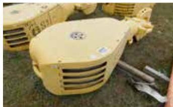
Ideco 360 Block-Hook Combo