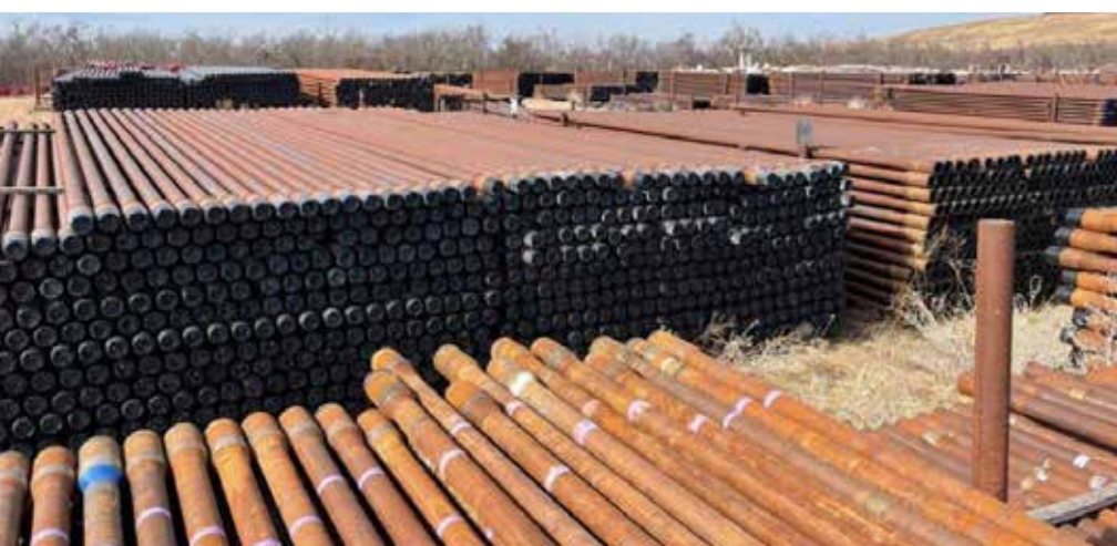
Unused – (18,553Ft) 4.5-Inch G105 Drill Pipe