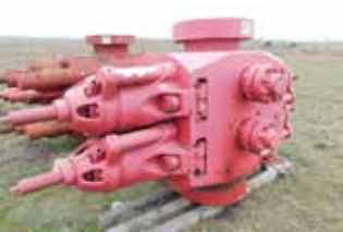
2009 NOV 10K Double BOP

Checkout: May 5th thru May 21st M-F, 8-4 | Contact: Billy Gamble @ 832.257.1628