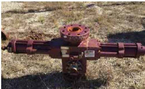
2013 NOV Blind Shear BOP