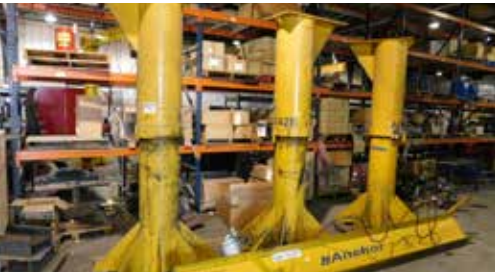
Anchor 2-Ton Overhead Cranes