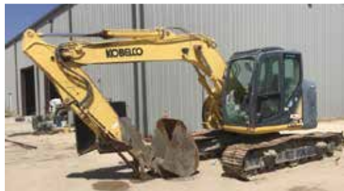
Kobelco SK140SRLC-3 Track Excavator

Equipment to sell? Talk to us today. www.ironplanet.com/KEConsign