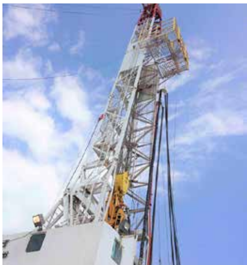
G.Denver 1000HP Drilling Rig