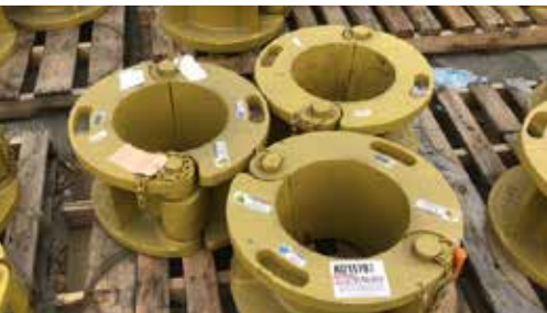
AOT Spider Bowls