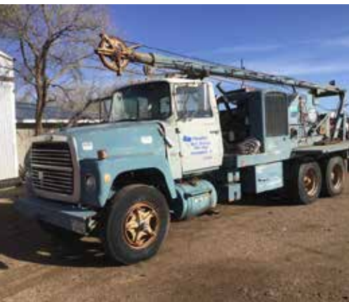
Wilson Super Single Swab Unit