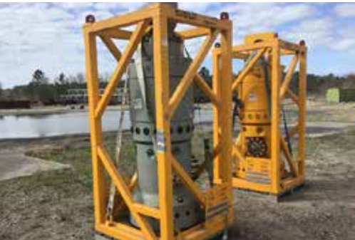
2 - URA Tubing Heads