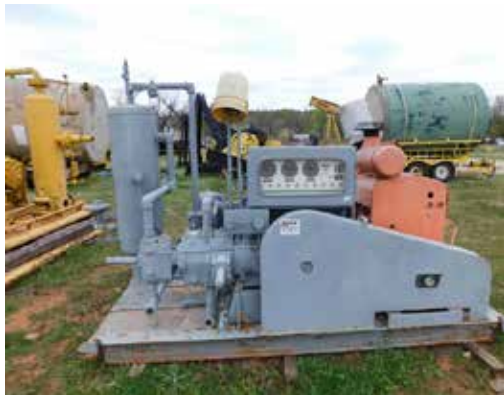
Knox-Western 2-Stage Gas Compressor