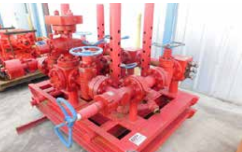
5M Choke Manifold – Yd 5