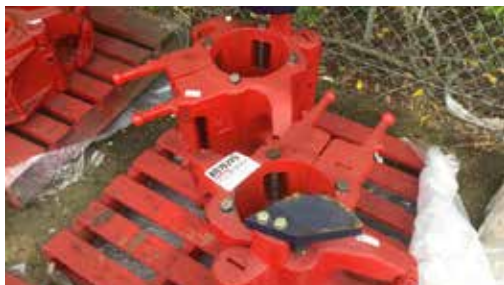
Slip-Type Tubing Elevators