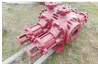
Shaffer 5K Double BOP