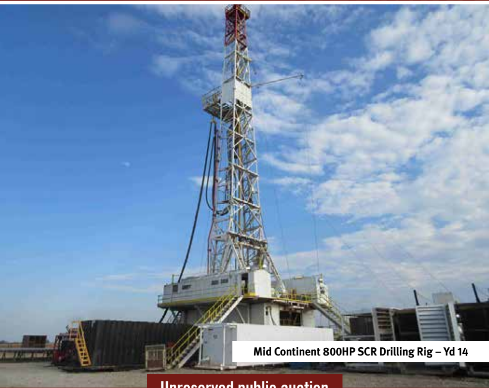
Mid Continent 800HP SCR Drilling Rig – Yd 14