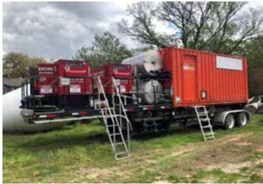
MI Swaco Fluid Waste Mgmt Unit