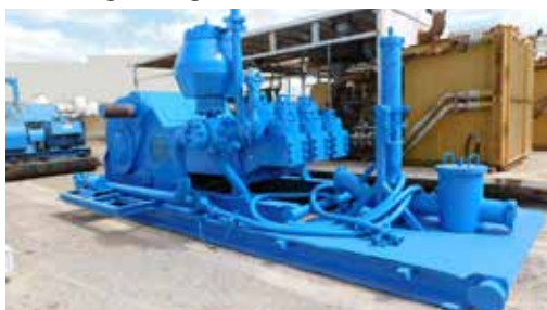
National 10-P-130 Triplex Pump