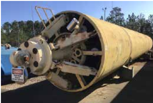
Dril-Quip Air Can