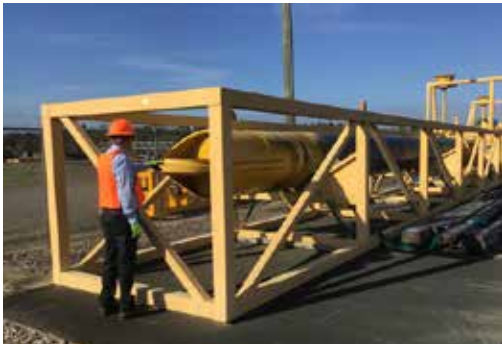
TBM Air Can Tendon