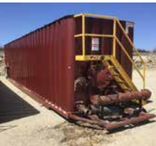
2011 Dragon 500 Bbl Frac Tank