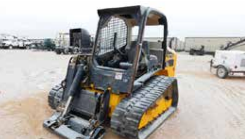
JCB 320T Skidsteer Loader