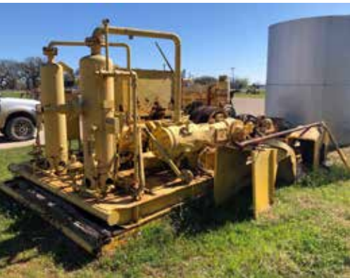
G. Denver 2-Stage Gas Compressor