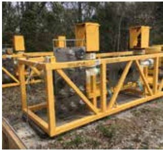
URA Valve Block Assembly