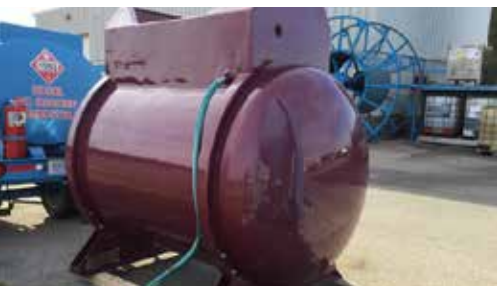
2012 Hawk 1080-Gal Acid Tank