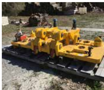
Hyd Tilt Table – Yd 3