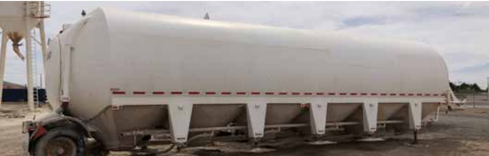
Retesa Barite Blimp Trailer