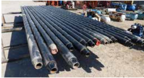
15 – 6.5-Inch Spiral Drill Collars