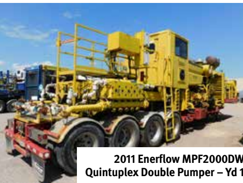
2011 Enerflow MPF2000DW Quintuplex Double Pumper – Yd 1