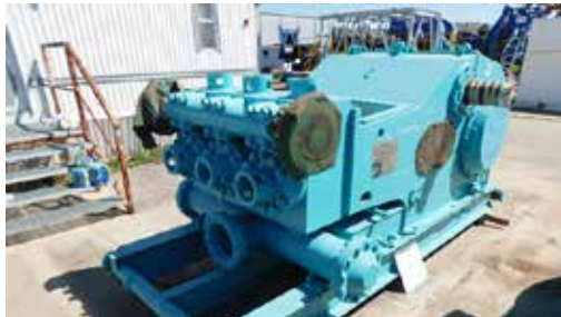
HT F-800 Triplex Pump