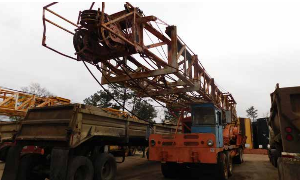
Moller Well Service Rig