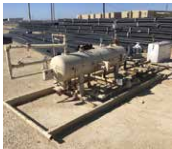
2008 TPS Test Separator