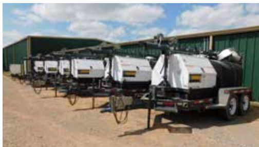
Magnum Light Tower-Water Tank Combos