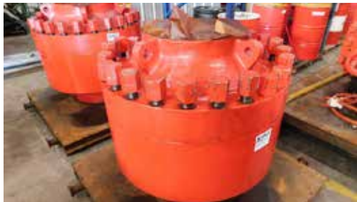
SK Petro 5M Ann BOP