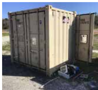
Electrical Control Room – Yd 3