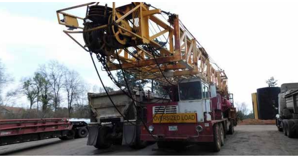
1975 Cooper Well Service Rig