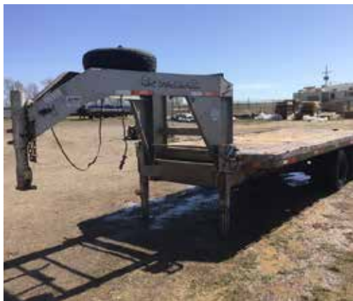
2007 Gooseneck Mfg GN Flatbed Trailer