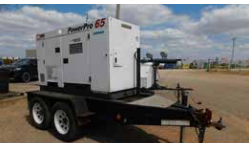
MMD PowerPro 65 Portable Generator