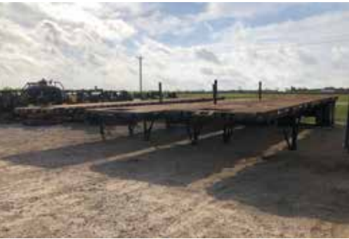
3 – Float Trailers