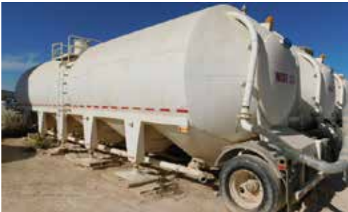
2012 Retesa Barite Blimp Trailer