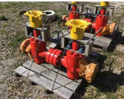
Axon 10M Gate Valves

Contact: Marty Norden @ 251-583-7638 | Email: marty.norden@manorden.com