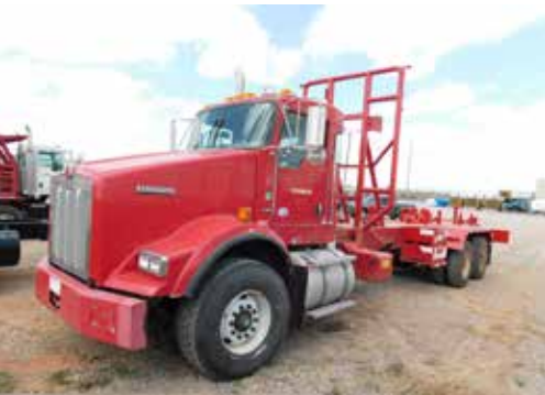
2013 Kenworth T800 BOP Transport Truck

Preview Starts: April 26th, M-F, 8-4 | MUST call in advance to schedule pick up | Checkout: May 5th thru May 21st M-F, 8-4 Contact: Lance Cross @ 405.596.4998 | Email: lcross@ritchiebros.com | Loadout Available up to 15,000#