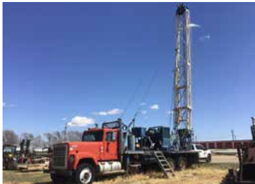
1981 International 70T Pump Hoist Truck – Yd 7