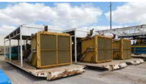
3 – Kato 902KW Gensets pb Caterpillar 3508s