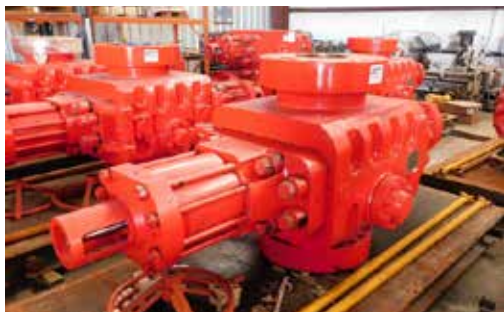
2013 SK Petro 10M Single BOP – Yd 5