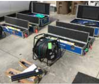
Sonardyne Surface Interface Unit Kits