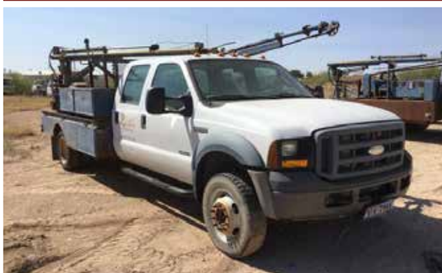
2006 Ford F450 Slickline Truck