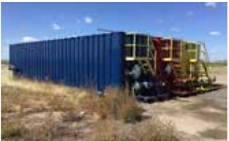
4- Dragon 500-Bbl Frac s