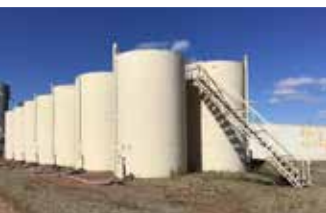
400-Bbl Containment Tanks