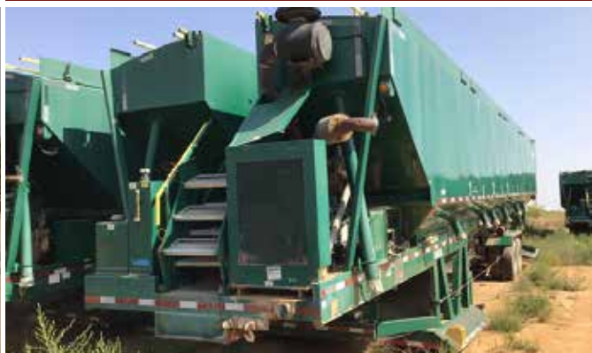
2011 Convey-All SK-4000