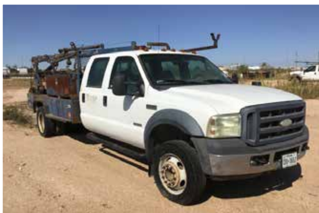
2006 Ford F550 Slickline Truck