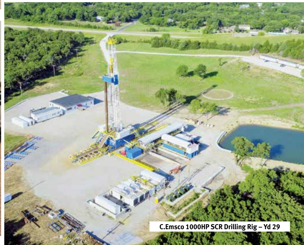
C.Emsco 1000HP SCR Drilling Rig – Yd 29