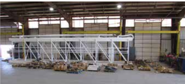
Unused Engine Surplus