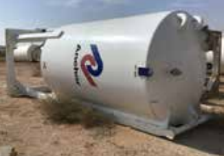
Barite 50T Storage Silo