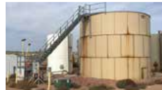
3000-Gal Containment Tank