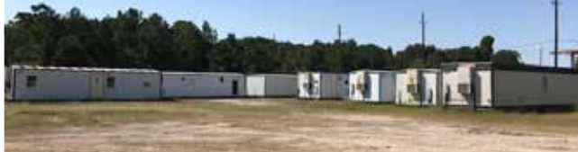
Ameritech Crew Quarters