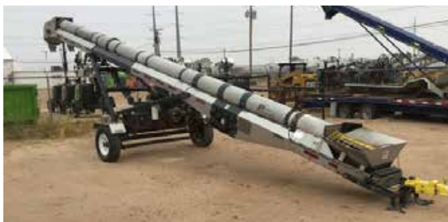
Convey-All CSS-1435 Sand Conveyor