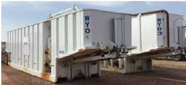
2 – 500-Bbl Mix Tanks