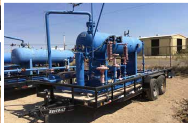
2013 Bestbuilt Sand Separator