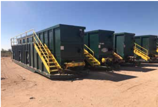
4 – Flowback Tanks