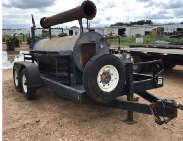
750 BTU Line Heater