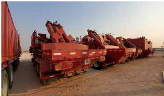
3 – 2010 NOV Frac Blenders