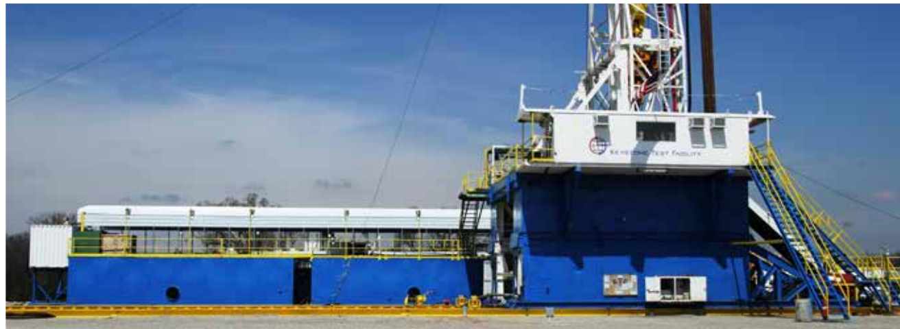
Mud System & 200'L Skidding System