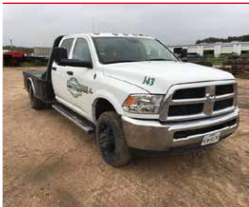
2018 Ram 3500 Flatbed – Yd 5