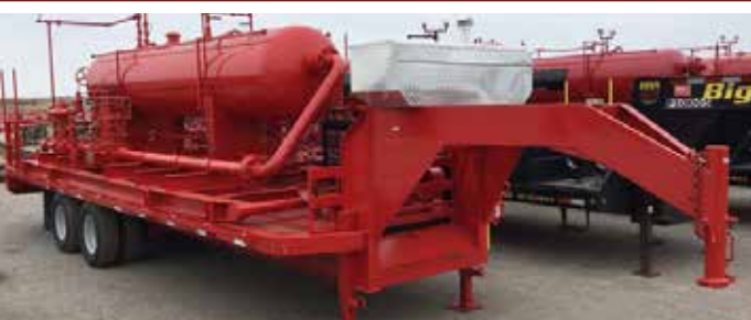
2015 Flowback Test Unit