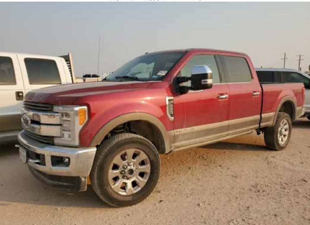
2018 Ford F250 King Ranch – Yd 2