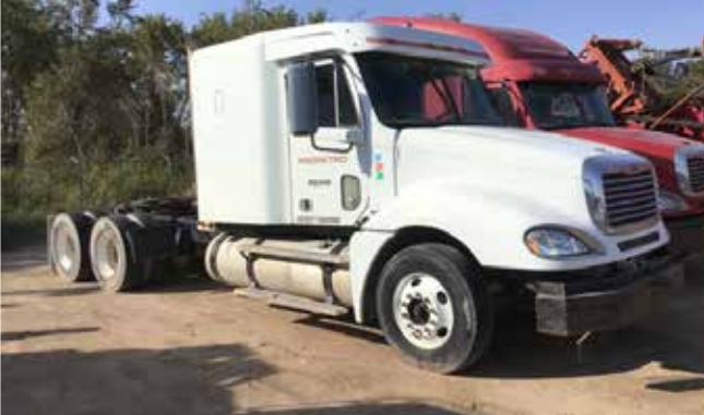
2009 Freightliner Columbia