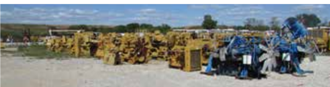
Caterpillar-Detroit Diesel Engines