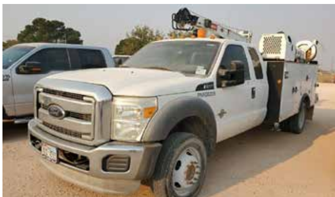
2011 Ford F550 Mechanics Truck