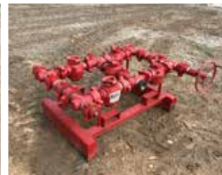
1502 Ground Manifold