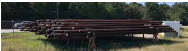
5 In. S-135 Drill Pipe

Planning to sell? Add your equipment to this great lineup.