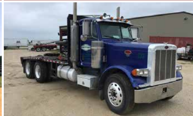
2007 Peterbilt 379 Winch Truck