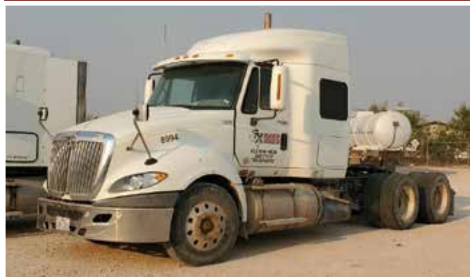
2012 International Prostar