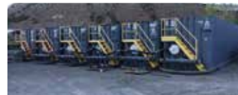
6 – Dragon 500-Bbl Frac Tanks