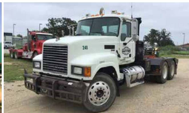
2014 Mack Winch Truck