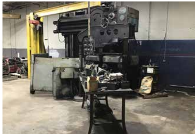
Bullard Vertical Turret Lathe

Add items you want to inspect to a watchlist at