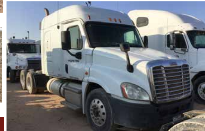
2013 Freightliner Cascadia