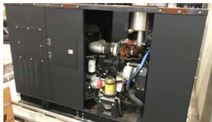
Cummins QSB4.5 Generator