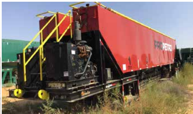
2015 Keystone MSB-2700