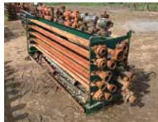
1502 Flow Iron