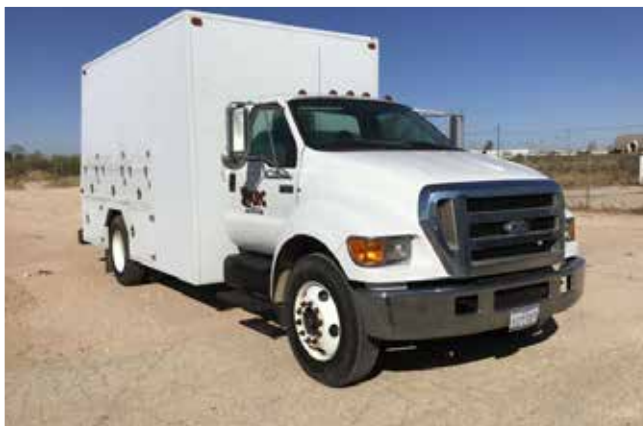
2006 Ford F650 Slickline Truck