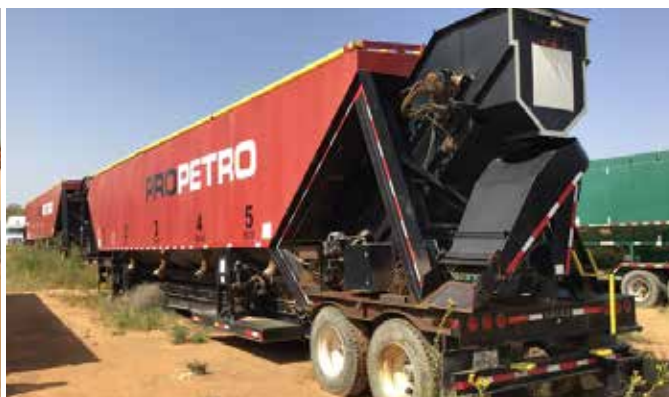
2015 Keystone MSB-2700