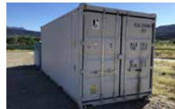
2019 Spinnaker Shipping Container