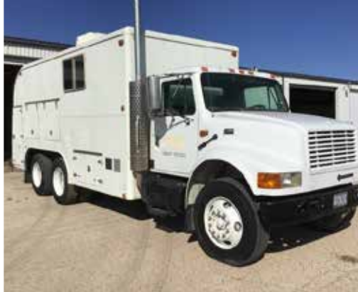
2000 International 4900 Slickline Truck – Yd 23