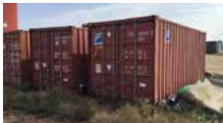
2 – 20'L Shipping Containers