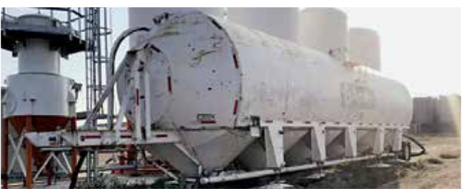
4100 Cu Ft Blimp Trailer