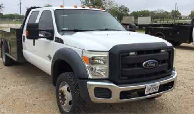
2012 Ford F550