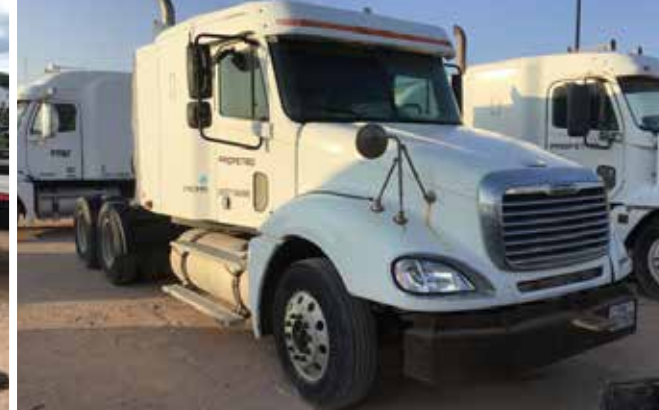
2006 Freightliner Columbia