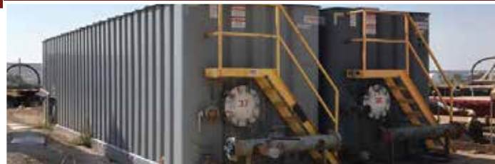
2 – Dragon 500-Bbl Frac Tanks