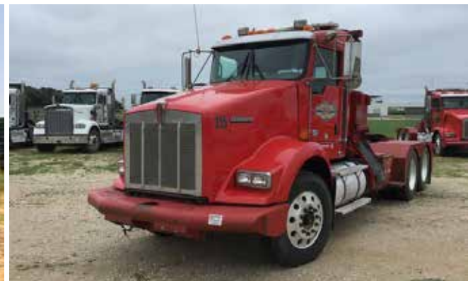
2013 Kenworth T800 Winch Truck