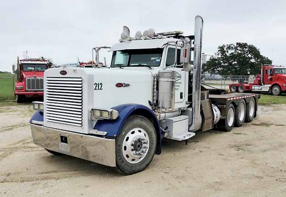
2005 Peterbilt 379 Winch – Yd 4