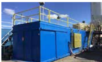
500-Bbl Mix Tank