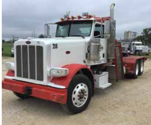
2012 Peterbilt 388 Winch Truck – Yd 4