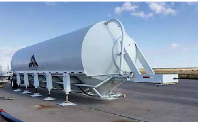
2007 Troxell Blimp Trailer – Yd 12