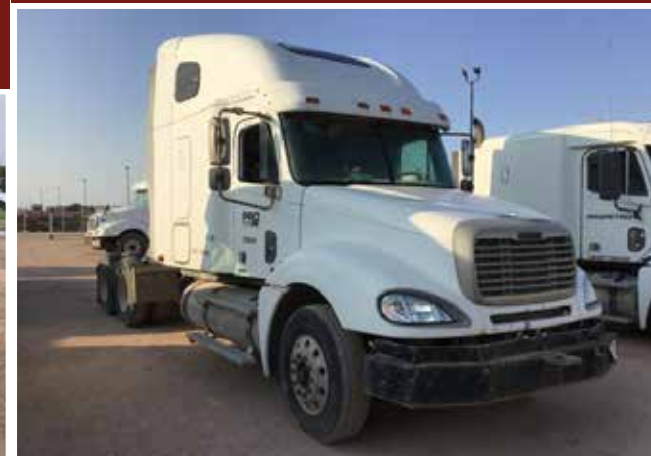
2006 Freightliner Columbia