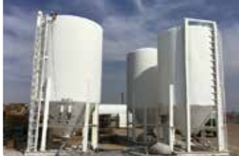
Barite 75T Storage Silos