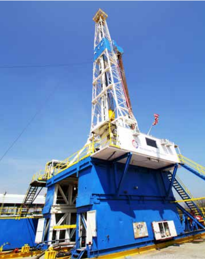
C.Emsco 142' 800K Mast & 20' Sub