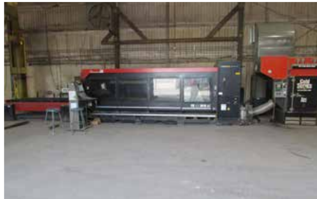
Amada Laser Cutter