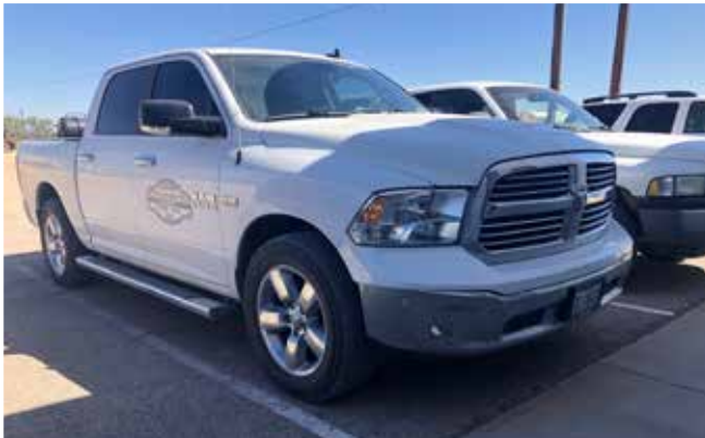
2017 Dodge Ram 1500