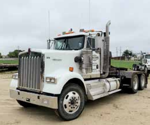
2013 Kenworth W900 Winch Truck – Yd 4