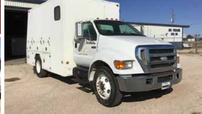
2006 Ford F650 Slickline Truck