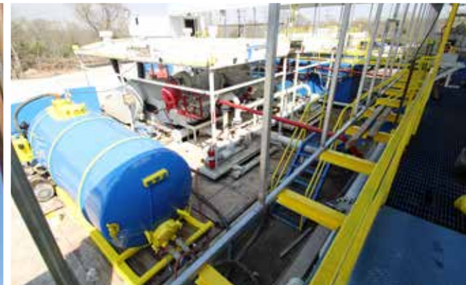
2 – C.Emsco FB1300 Mud Pumps