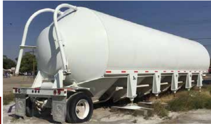
3- Troxell 4000CuFt Blimp Trailers