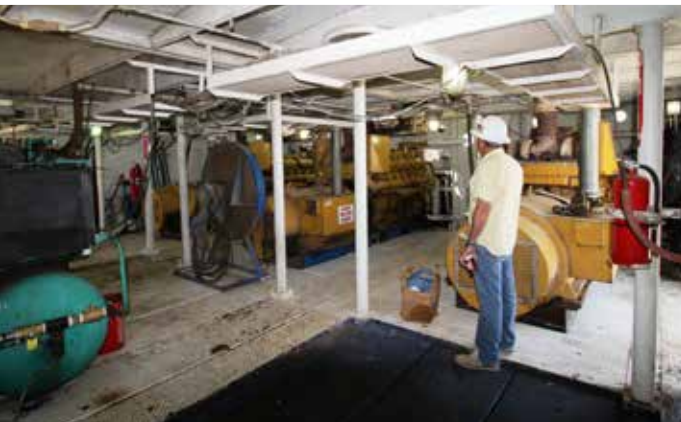
3 – Kato 800 KW Generators