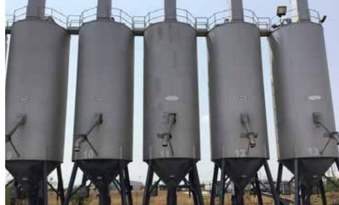
2011 Appco 4000E Sand Silos