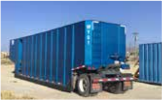
2012 CT Fab 500-Bbl Mix Tank