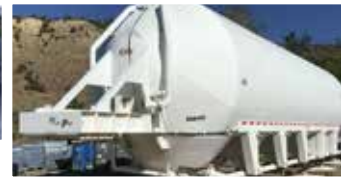
2012 EXA Blimp Trailer