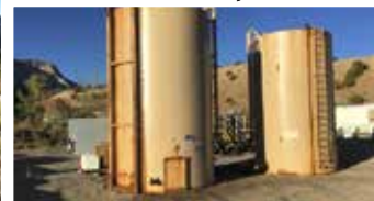
2010 Tuff-E Containment Tanks