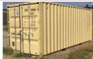
20'L Shipping Container