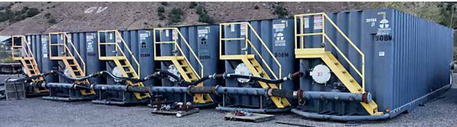
6 – Dragon 500-Bbl Frac Tanks – Yd 1