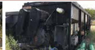
IntegriCert Effluent Tanks