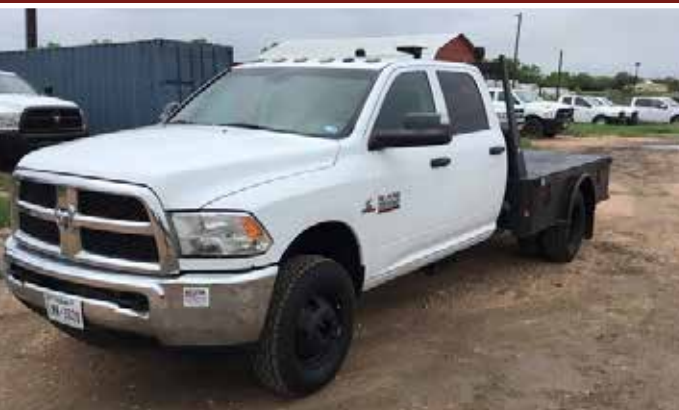
2017 Ram 3500