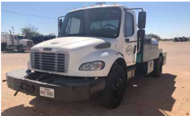
Freightliner Tubing Tester Truck