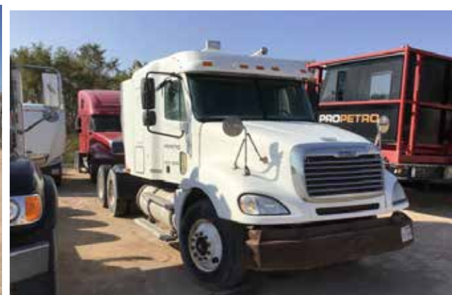
2006 Freightliner Columbia