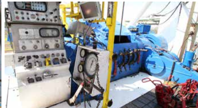
C.Emsco 1000 HP Drawworks