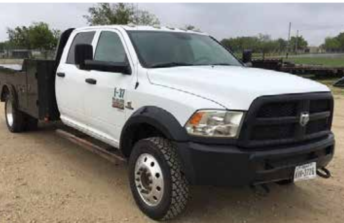
2016 Dodge Ram 5500