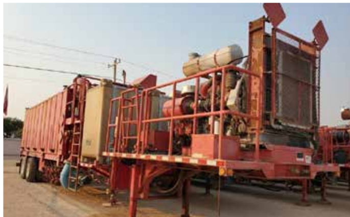
2011 NOV Rolligon HT-180 Hydration Unit – Yd 2