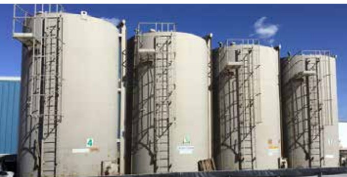
400-Bbl Containment Tanks