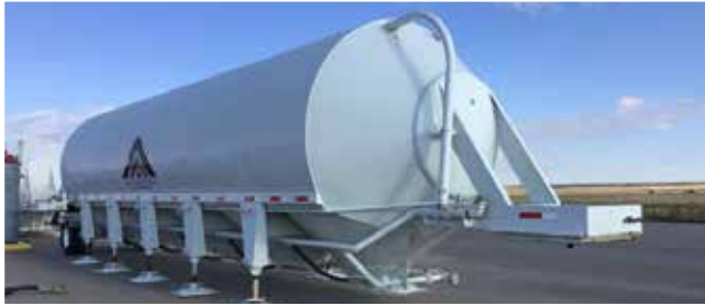
2007 Troxell Blimp Trailer