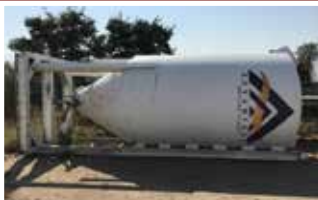
50T Upright Bulk Tank