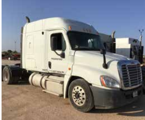
2011 Freightliner Cascadia – Yd 6