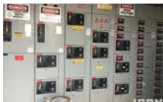
Cummins 455KW Genset