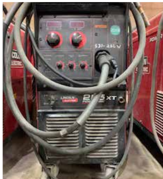
255 XT Power Mig