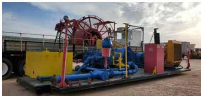
National 7-P-50 500HP Triplex Slush Pump