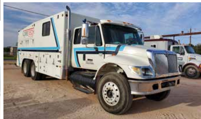
International 7500 Wireline Truck