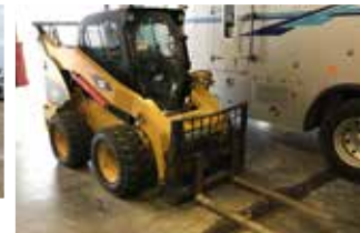
Caterpillar 262C XPS