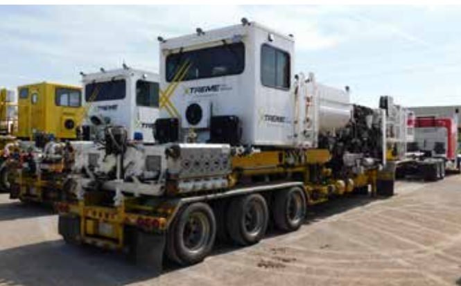
2017 Serva 1000HP Quintuplex Double Pump – Yd 1