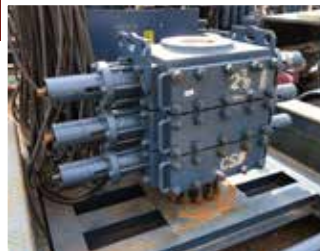
Yankee 5M Triple BOP