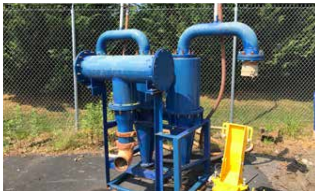
NOV Brandt Hydro Cyclone