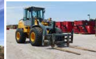
John Deere 444J