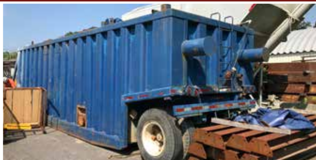
VE Enterprises Frac Tank