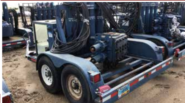
Yankee 5M Double BOP-Closing Unit Combo