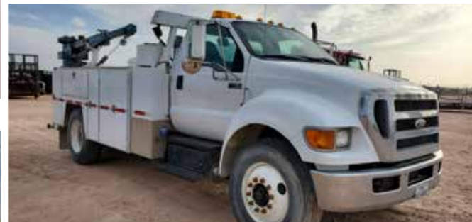
Ford F750 Mechanics Truck