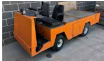
Nordskog 280B Electric Cart