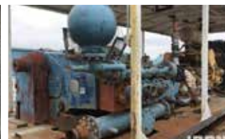
Bomco F1000 Triplex Pump