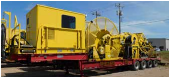
NOV Hydra Rig 580 Coiled-Tubing Rig