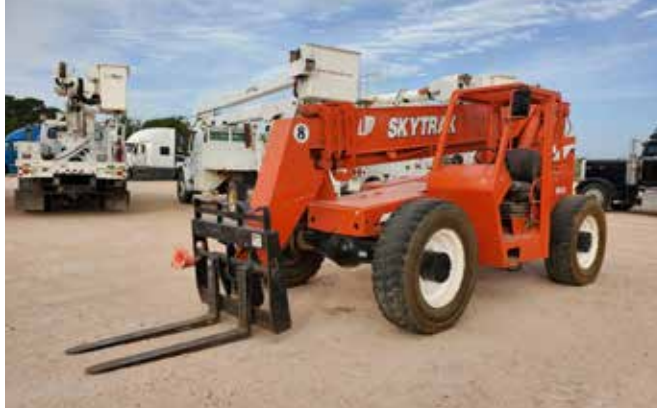
Skytrak 8042 Telehandler – Yd 2