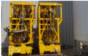
2 of 3 – Fluid Design 120K Injectors