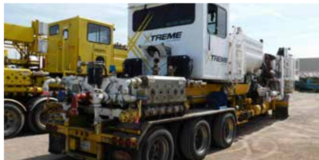
2015 Serva 1000HP Quintuplex Double Pumper