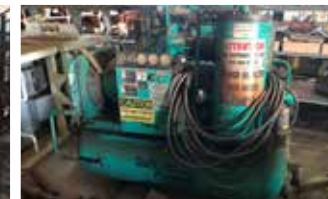
Sullivan Palatek Air Compressor