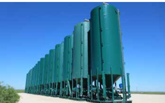
FB Ind. SS-240 Vertical Sand Storage Tanks – Yd 2