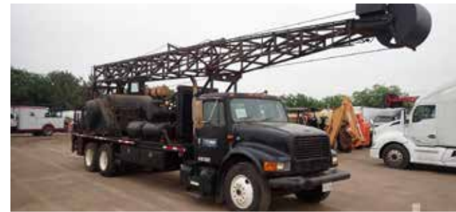
International 4900 Swab Unit