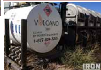
2012 Dryair V1 Volcano Frac Heater