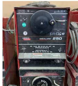
Ideal Arc Stick Machine