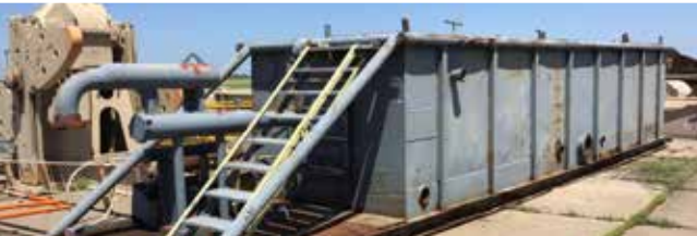
30'L Mud Suction Tank