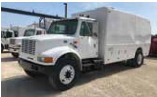
International 4900 Slickline Truck