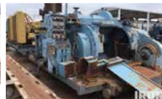
National 610M Drilling Rig