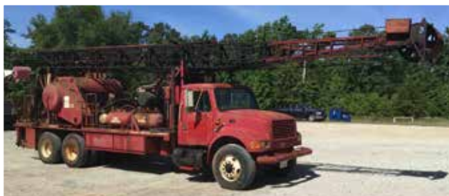
International 4900 Swab Unit