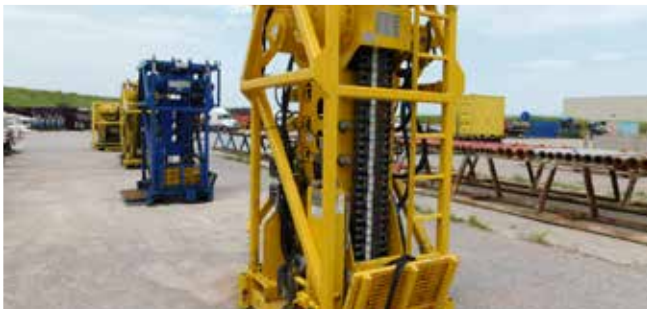
NOV Hydra Rig 6100 Injector