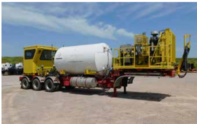
2012 NOV Hydra Rig Triplex Nitrogen Pump – Yd 1