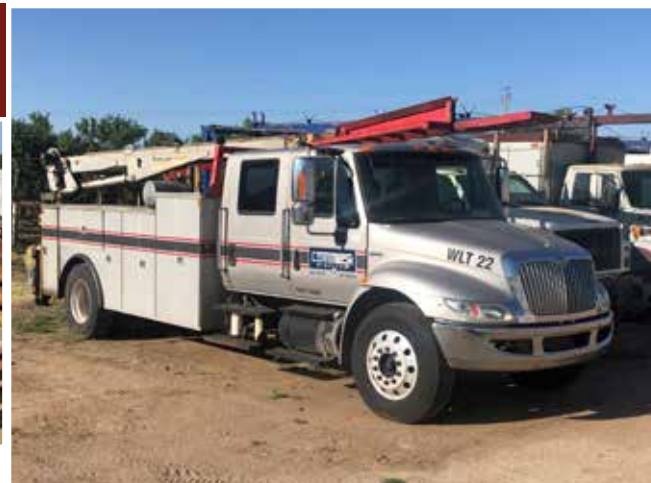
International Service Truck