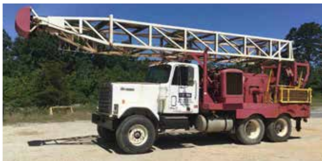
Chevrolet Bison Swab Unit