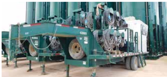
Crash Rescue Gooseneck Control Trailer