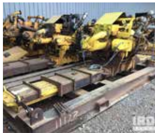
Venture Tech 250T Top Drive