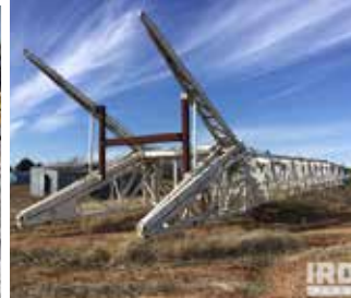
Superior 141'H 500K SHL Mast