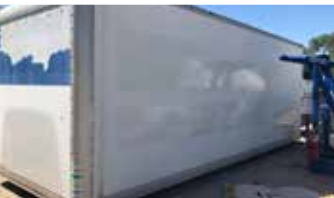
Enclosed Truck Bed