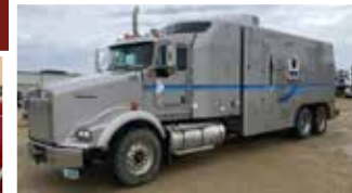
2015 Kenworth T800 Wireline Truck