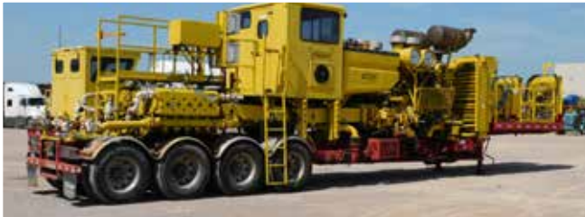
NOV 1000HP Quintuplex Double Pumper