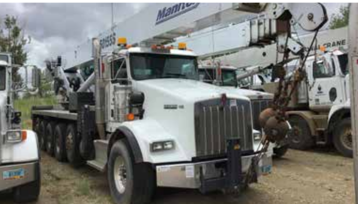
2015 Kenworth T800 Crane Truck – Yd 20