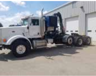
2007 Peterbilt 357 HPU Truck