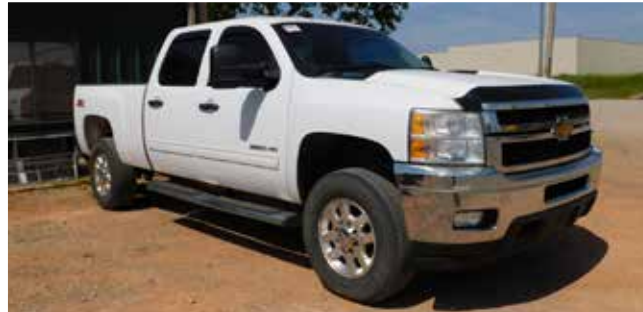
2014 Chevrolet 2500HD