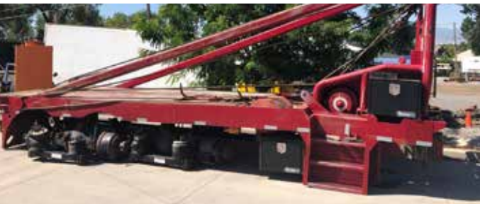
Hodges Winch Bed