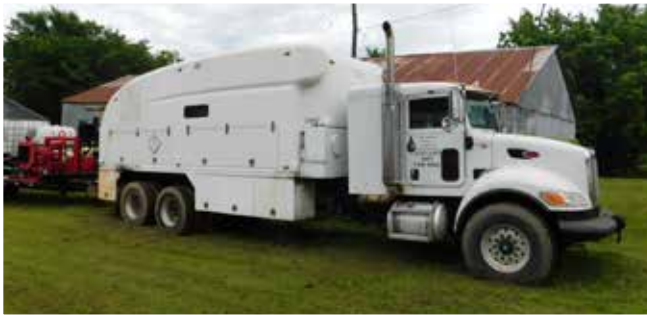
Peterbilt Wireline Truck