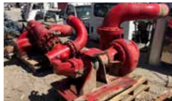
12x14 Cent Pumps