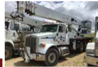
2012 Peterbilt 367 Crane Truck