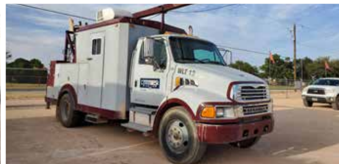
Sterling Slickline Truck