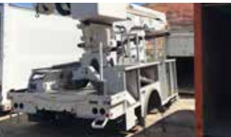
Altec Bucket Truck Body