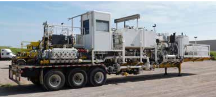
2012 Serva QPA1000 Quintuplex Double Pumper – Yd 1