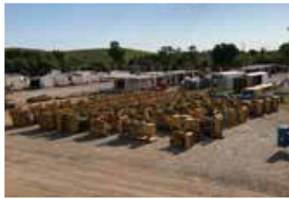
Caterpillar Engines & Gensets