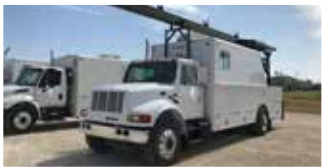
International 4900 Slickline Truck