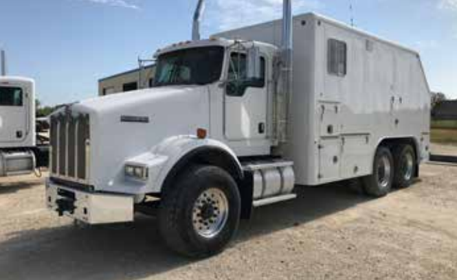
Kenworth T800 Wireline Truck – Yd 12