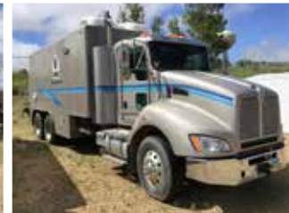
2012 Kenworth Wireline Truck