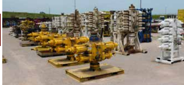
Coiled Tubing BOPs