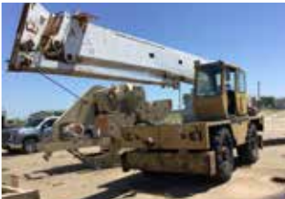
Bantam S626 Crane