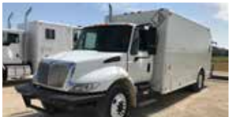
International 4300SBA Wireline Truck