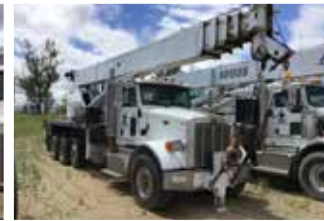
2013 Peterbilt 367 Crane Truck