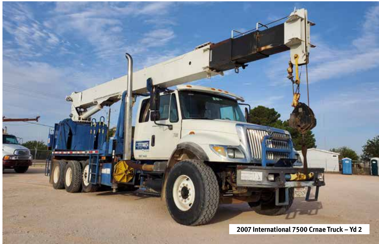
2007 International 7500 Crane Truck – Yd 2