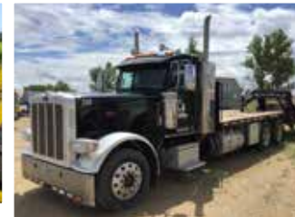
Peterbilt 389 Flatbed Truck