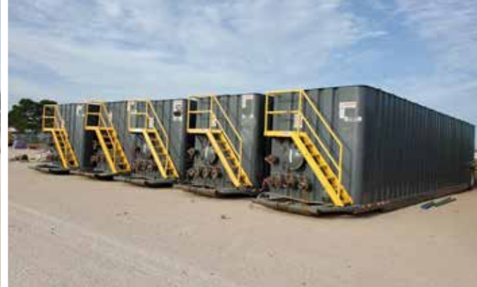
5 – Dragon 500-Bbl Frac Tanks – Yd 2