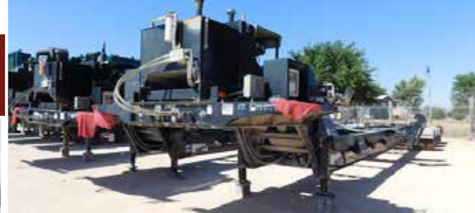
Cancade Company Ltd Silo Transport Trailer