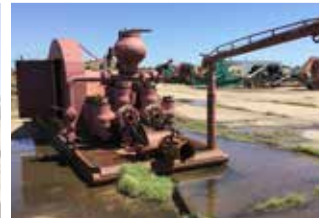
Rubicon 600 Duplex Pump