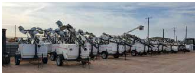
Allmand Portable Light Towers