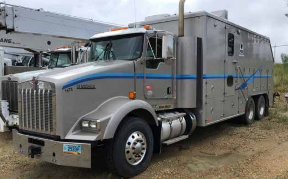
2015 Kenworth T800 Wireline Truck – Yd 20