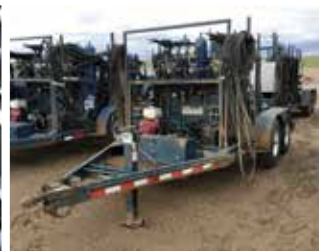
BOP-Closing Unit Combo