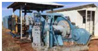
Skytop Brewster N46 Drilling Rig