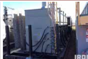
2012 Dryair V1 Volcano Frac Heater