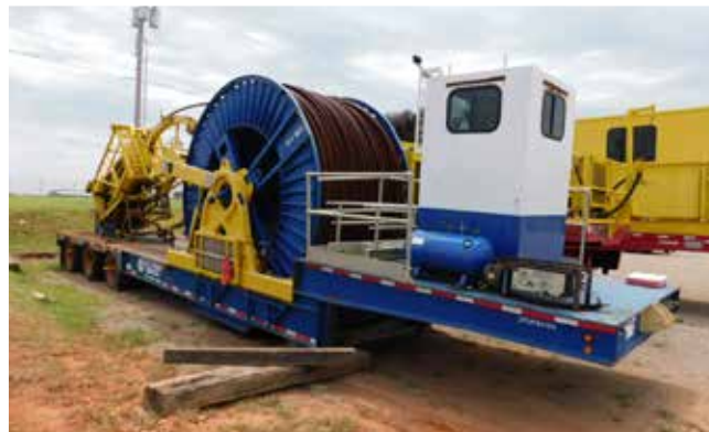
NOV Hydra Rig 580 Coiled-Tubing Unit