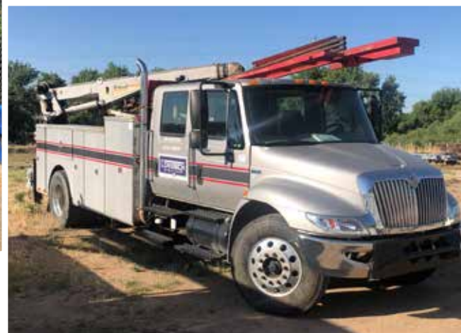
International Service Truck