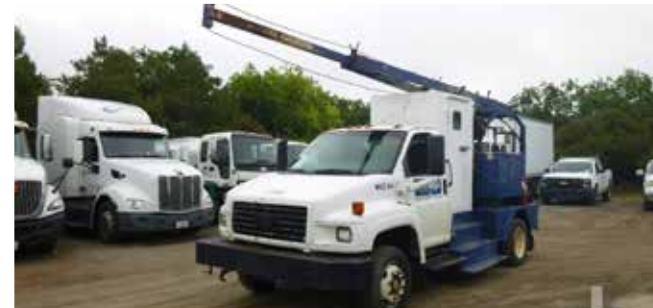
Chevrolet C4500 Slickline Truck