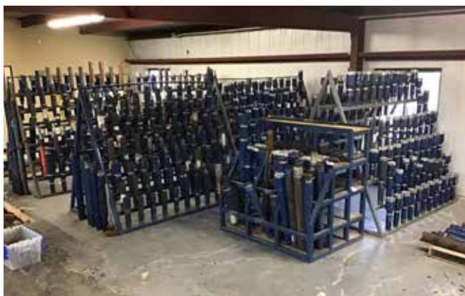
Fishing-Rental Tools – Yd 1