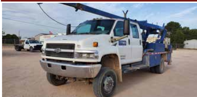
Chevrolet Slickline Truck