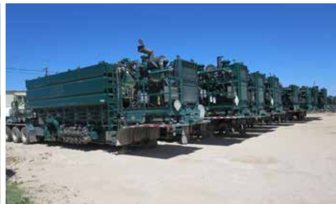
Energrow 80BPM Hydration Units – Yd 2