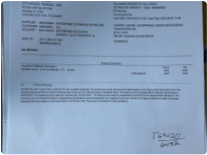
12e5ff8e00b84ca48d3ee643b62f2c1d.jpg Uploaded on Oct 13, 2025 10:17 AM