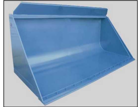
Bucket with Spill Guard

Radius bottom with square reinforced heel (Great for back dragging)